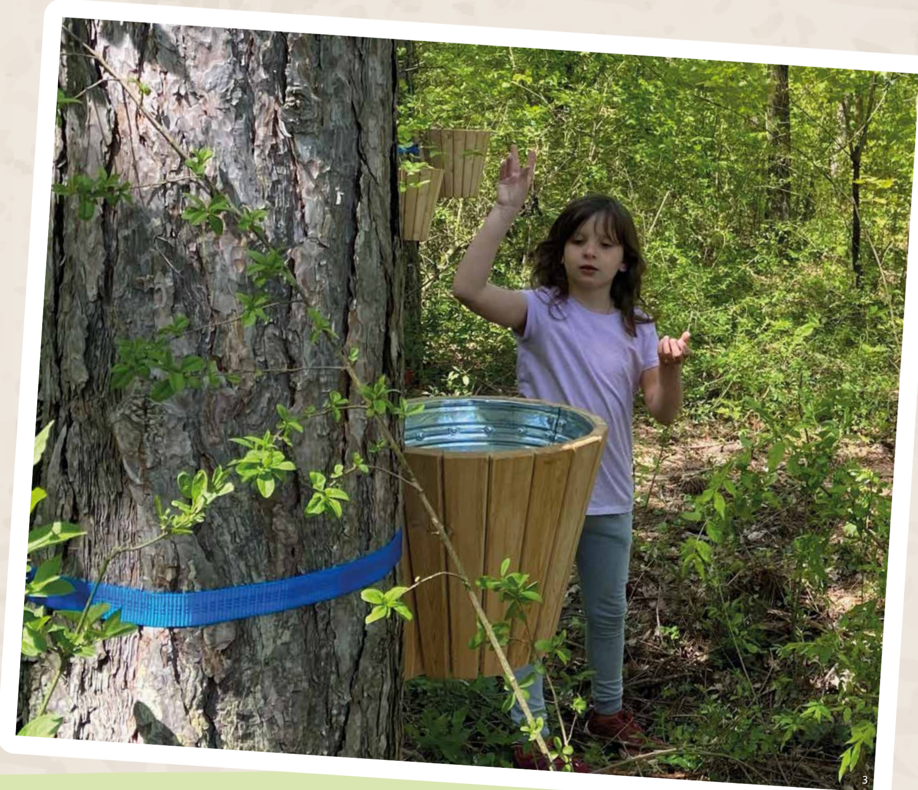
Busy like the SQUIRREL!