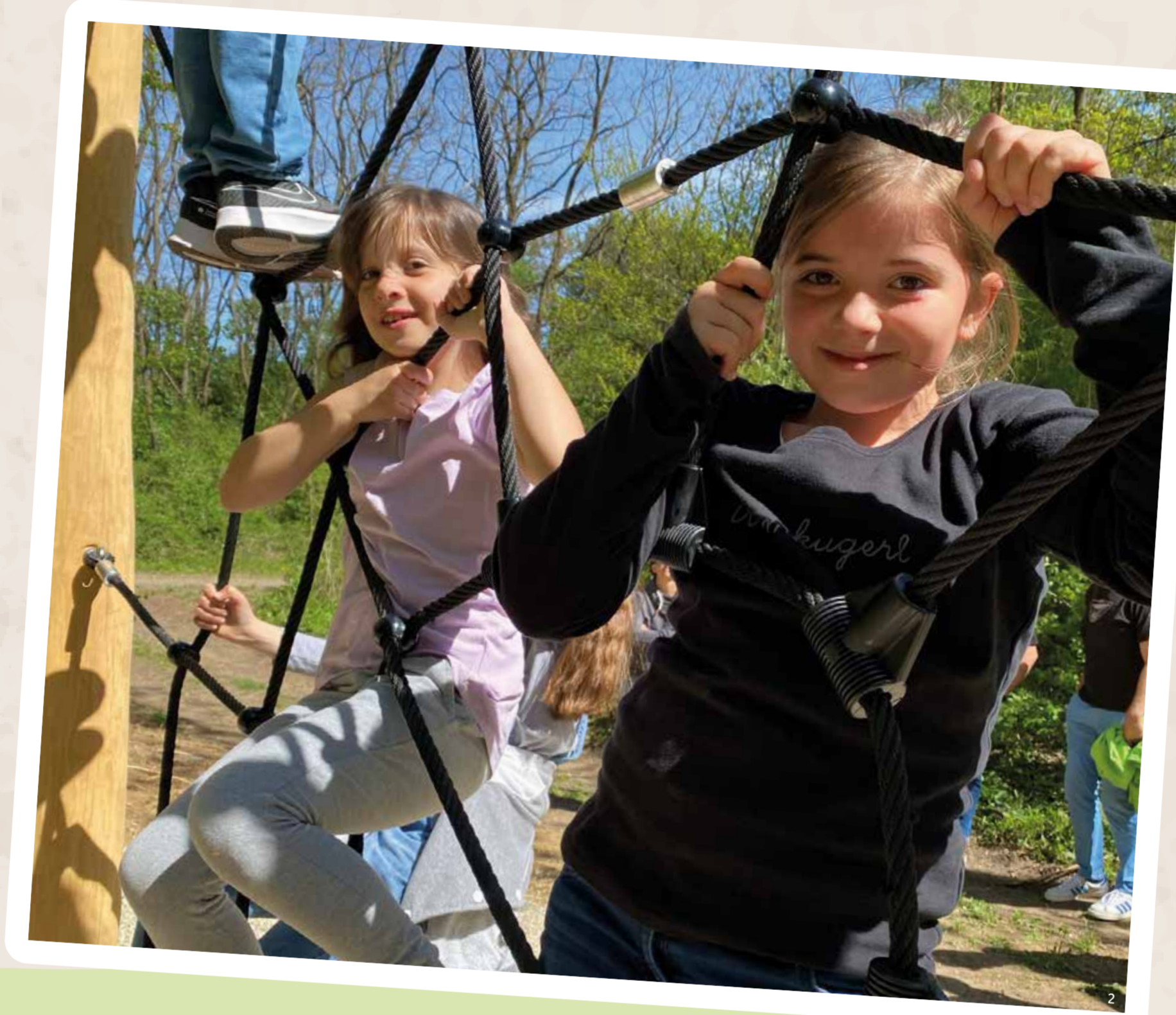
Sensitive like the WASP SPIDER!