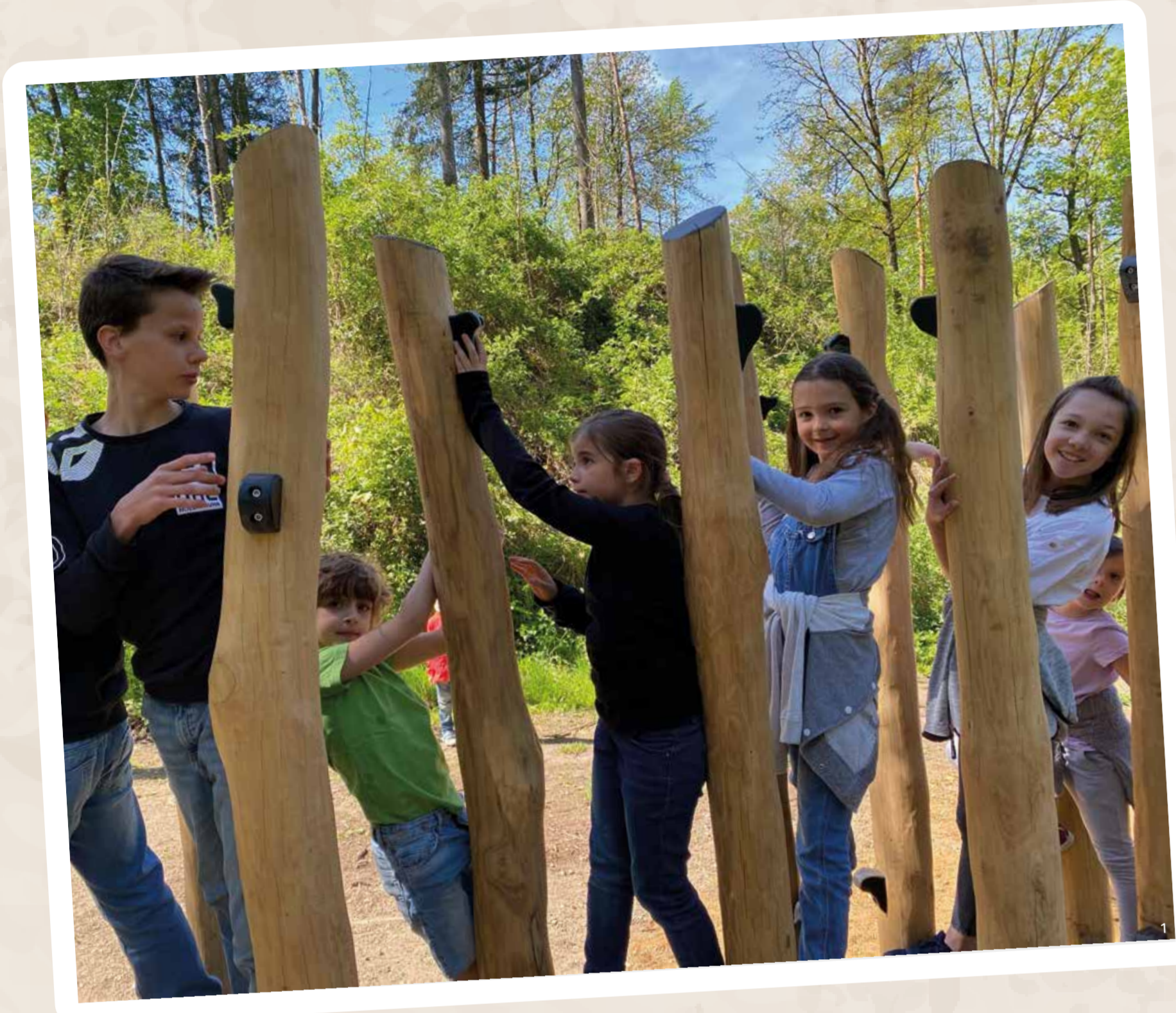
Swift like the SAND LIZARD!