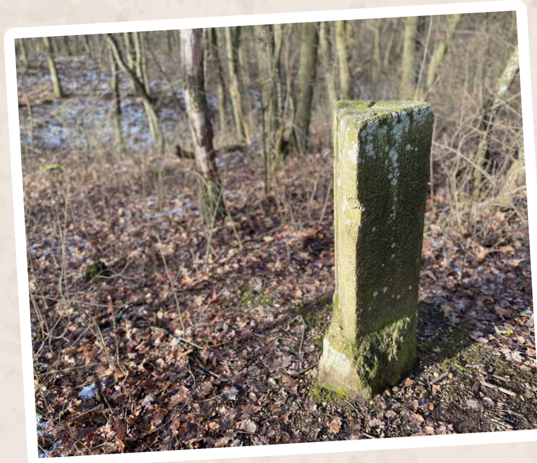
The DREIECKERTE STOAN ("TRIANGULAR STONE") originally marked the boundary of three cadastral communes. Since around 1780 it pointed out the routes to the villages Magersdorf, Raschala and Gaisberg. Gaisberg is a woodland enclave which at one time was a part of Oberhollabrunn municipality.